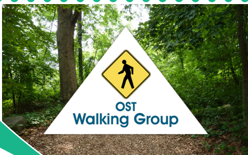
Rabbi Rosalin Mandelberg

Whether your winter tradition includes a tree, a menorah, or both, be sure to celebrate the uniqueness of Chanukah and, by all means, be the light in the world you wish to see! ☆