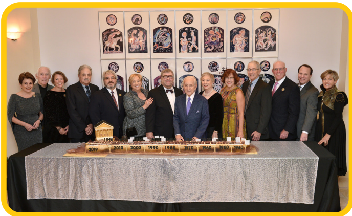
14 of our Presidents were present at the 175th Anniversary Gala.

• Ohef Sholom Temple's 175th Gala: A resounding success! Nearly 300 people arrived dressed up or dressy to the event of "our quarter century." The evening was beyond expectations, and really had something for everyone. As one congregant said a few days later, "I got there at 6:30 with plans to be gone by 8, but stayed until 11!"