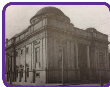
OST's Monticello Street Temple

buildings in the South. The gray brick building was designed in the Italian Renaissance style, measured 80 feet square and two stories high, and had a center dome that measured 40 feet in diameter and four smaller domes, all of which were copper-covered.