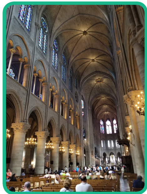
Notre Dame Interior, August 22, 2018

As I reflect on this now, I am so grateful for the sacred space that those who came before us created here at Ohef Sholom, but more so for the spiritual work of nearly two centuries that has happened within it. Like Notre Dame, which has been rebuilt many times throughout history, we have reinvented ourselves over and over again. We have weathered our challenges together, and will continue to do so. Even if, one day, our beautiful building no longer stands, its impact will remain. Creation cannot be destroyed. It can only continue, so long as we are committed to being a part of it. ☆