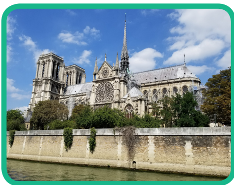
Notre Dame Cathedral, August 22, 2018