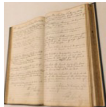
OST Minute Book 1867 - 1880